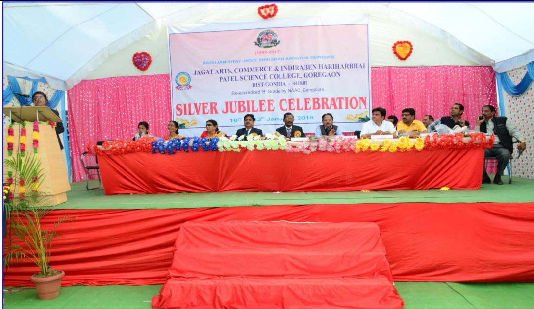
Hon'ble Shri. Rajkumar Badole, Minister of Social Justice & Special Assistance, Deptt, Govt. Of Maha., Hon'ble Shri. Vijayji Rahangdale, MLA., Tirora Constituency and other dignitaries on dais for valedictory function