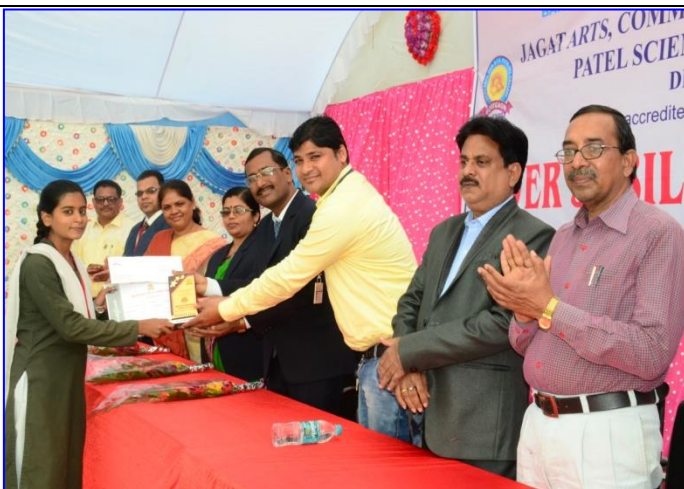
Prize distribution of intercollegiate competition during Silver Jubilee Celebration