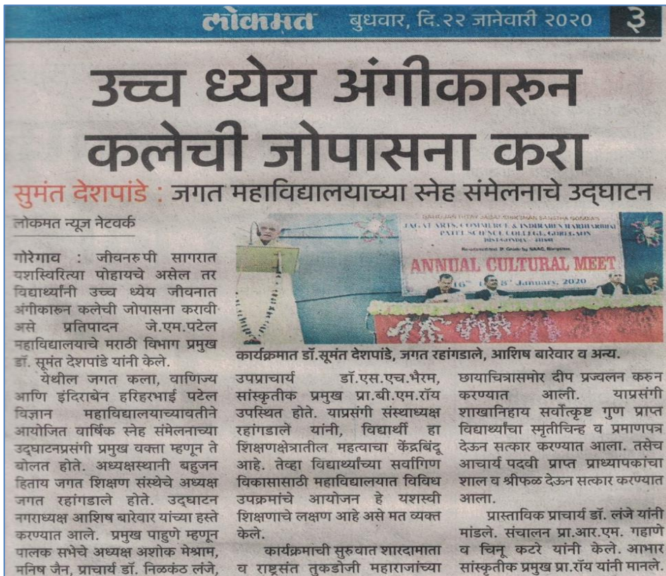
A news was published in Lokmat