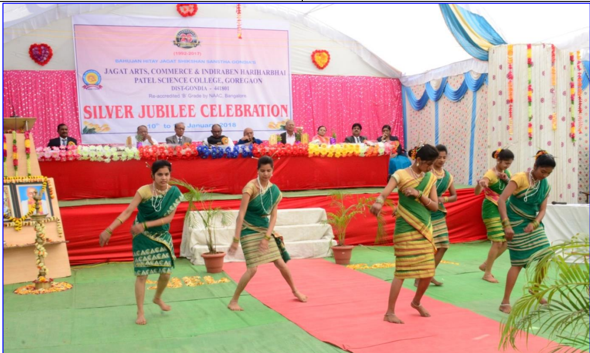
Dignitaries during inauguration of Silver Jubilee Celebration were present on dais