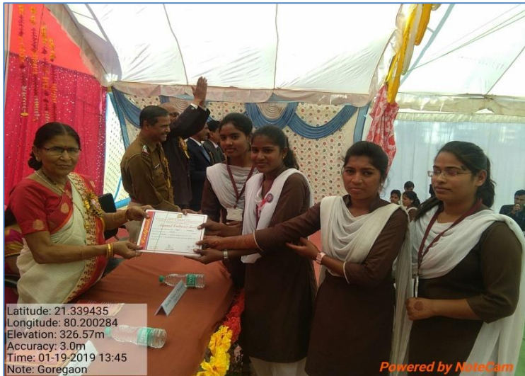
Staff & Students take pleasure in the cultural events

Latitude: 21.339435 Longitude: 80.200284 Elevation: 326.57m Accuracy: 3.0m Time: 01-19-2019 13:45 Note: Goregaon