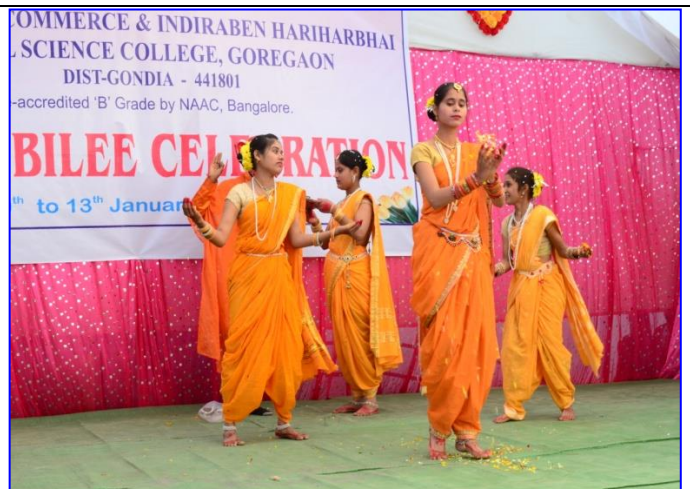
Group dance performed by students during celebration