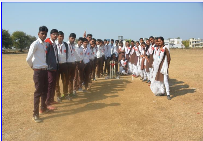
Boys and Girls players a were ready for playing the Cricket