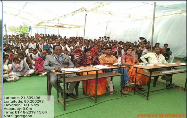
Staff & Students take pleasure in the cultural events