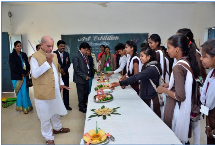
Hon'ble Shri Jagatramji Rahangdale Inagurated the Art Exhibition