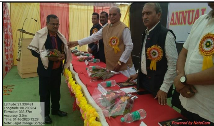
Hon'ble Shri Jagatramji Rahangdale act together with students during inaguration of cultural meet

Latitude: 21.339481 Longitude: 80.200264 Elevation: 333.57m Accuracy: 3.0m Time: 01-16-2020 12:29 Note: Jagat College Goregaon