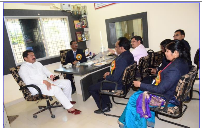
Shri. Nanabhau Patole (Ex-MP) in discussion after inaugural ceremony