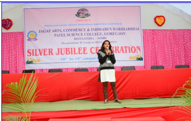
A student presented activity during celebration